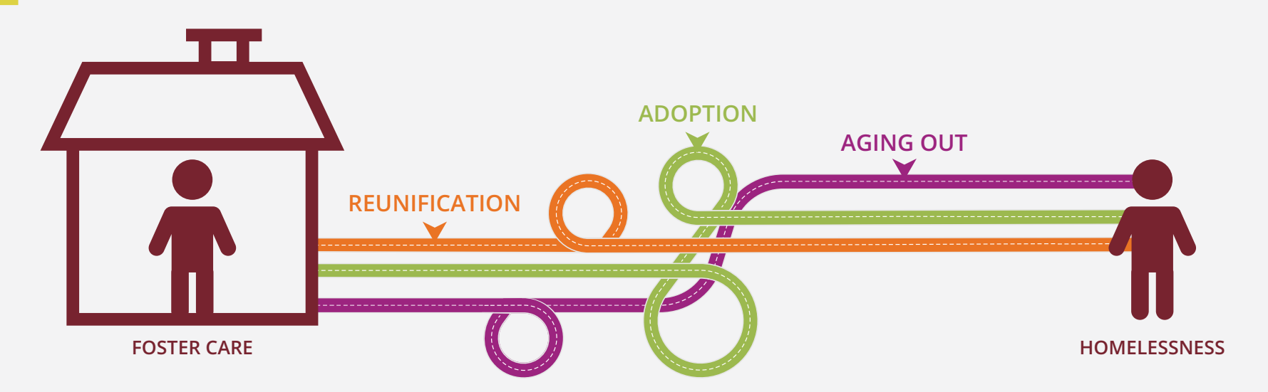
Figure 1. Pathways from foster care to homelessness

Although every young person's story is unique, some general patterns emerged when we explored the experiences of the young people who exited foster care in different ways.